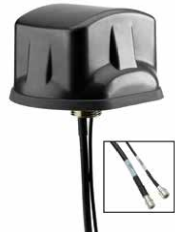
GLMBWIFI-QMA antenna with cables