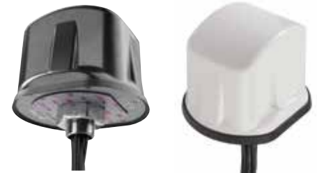
GLHPDLTEMIMO-LTB and GLHPDLTEMIMO-LTW

The Trooper antennas provide optimal 4G LTE and dual-band 802.11ac Wi-Fi coverage in a single, low-profile housing. Its compact footprint makes this antenna ideal for installation on surfaces with limited surface space, including leading public safety vehicle rooftops and many machine-to-machine applications. The antennas also incorporate PCTEL's unique high rejection GPS/GLONASS technology for optimal performance and support of carrier voice and data networks.