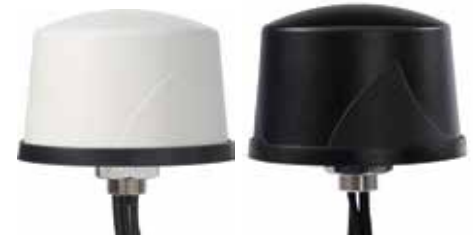
GLHPDLTEMIMO-SF (left) BGLHPDLTEMIMO-SF (right)