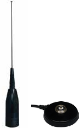
PCTWSLMR PCTMAG-HD Mount (sold separately)